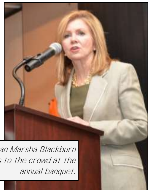
Congressman Marsha Blackburn speaks to the crowd at the annual banquet.

Big Chamber congrats to all the nominees and winners! Big Chamber thanks to all sponsors and attendees!